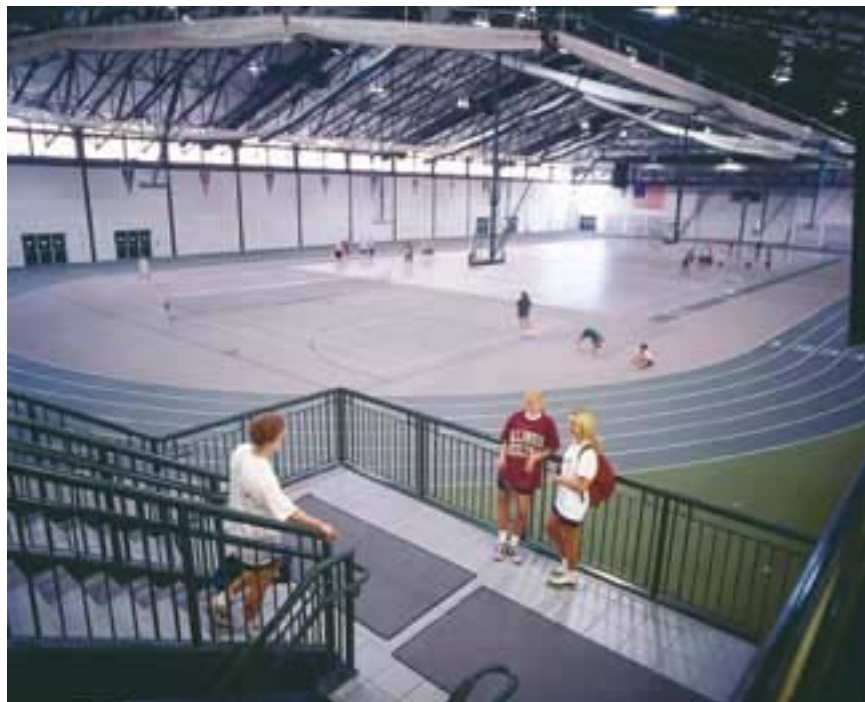
View of the Indoor Track from Second level of Shirk Center

A detailed schedule will be printed after all entries have been submitted