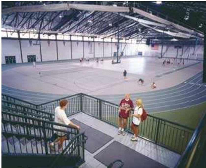
View of the Indoor Track from Second level of Shirk Center

A detailed schedule will be printed after all entries have been submitted